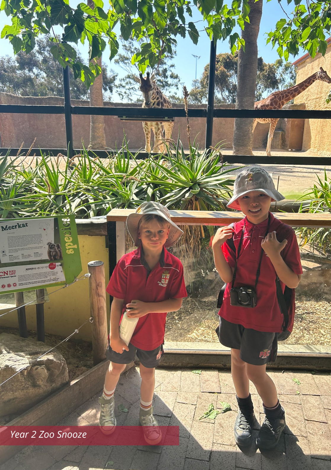
Year 2 Zoo Snooze