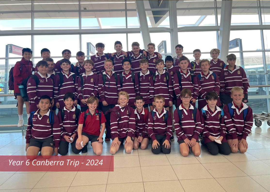
Year 6 Canberra Trip - 2024