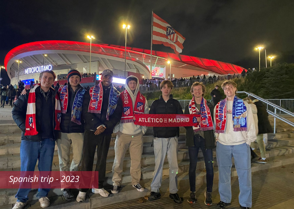
Spanish trip - 2023