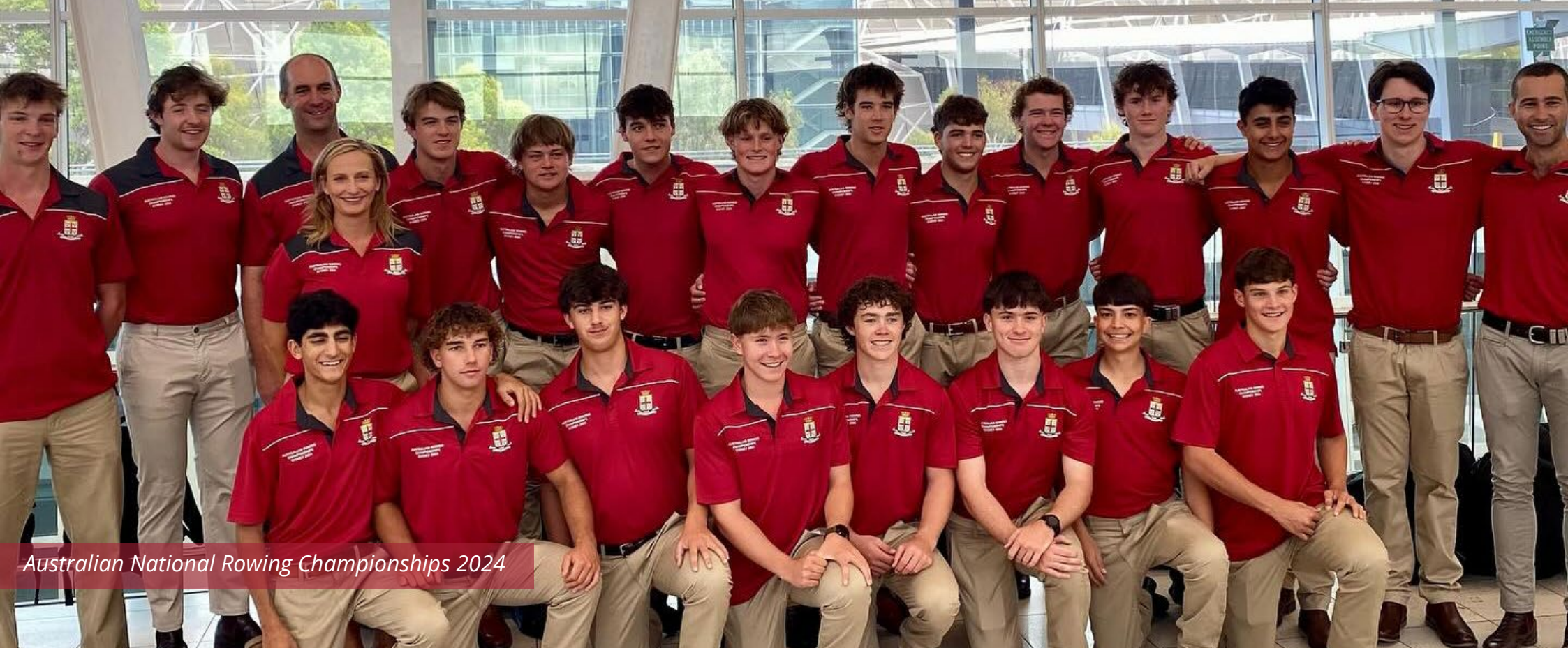
Australian National Rowing Championships 2024