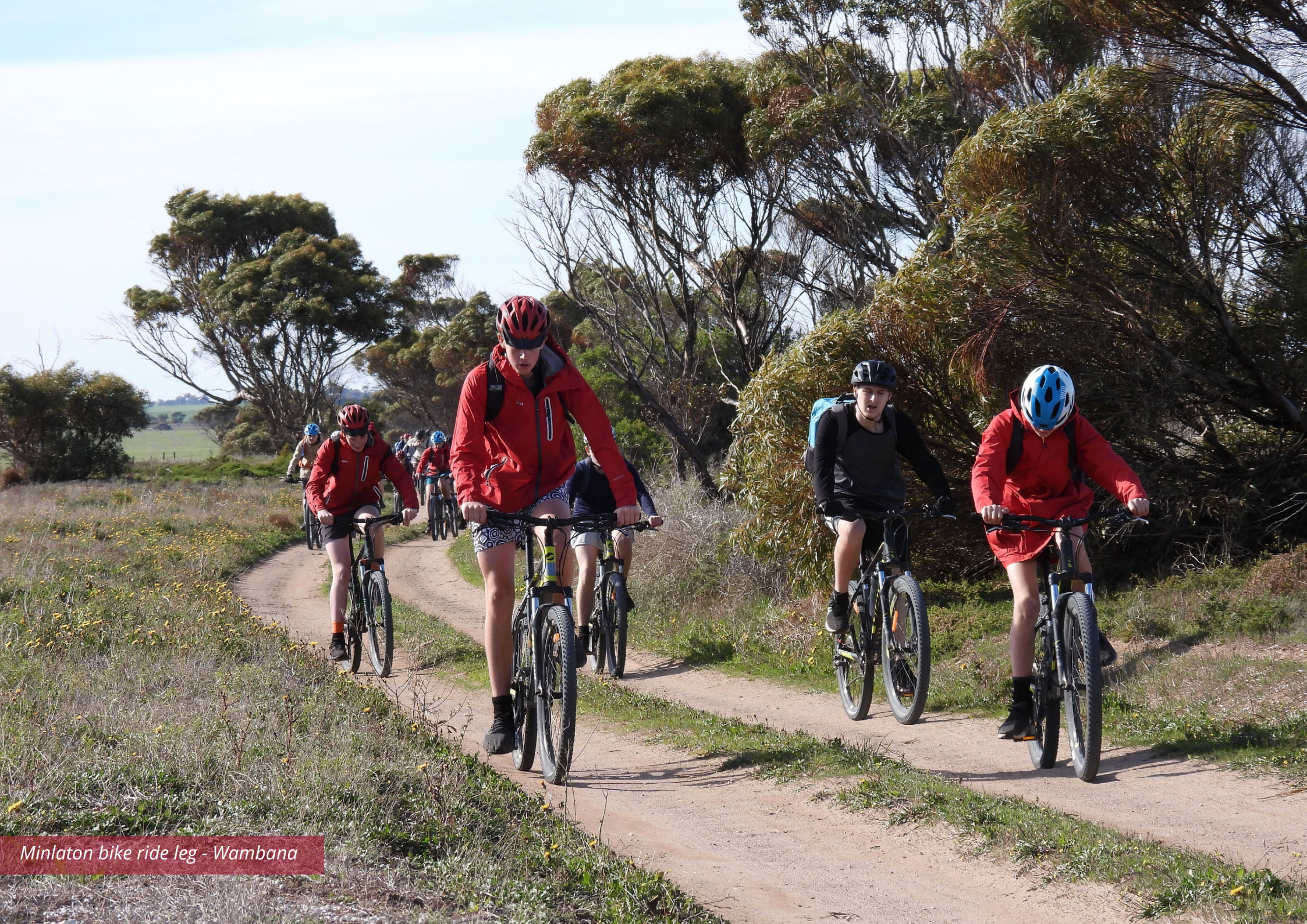
Minlaton bike ride leg - Wambana