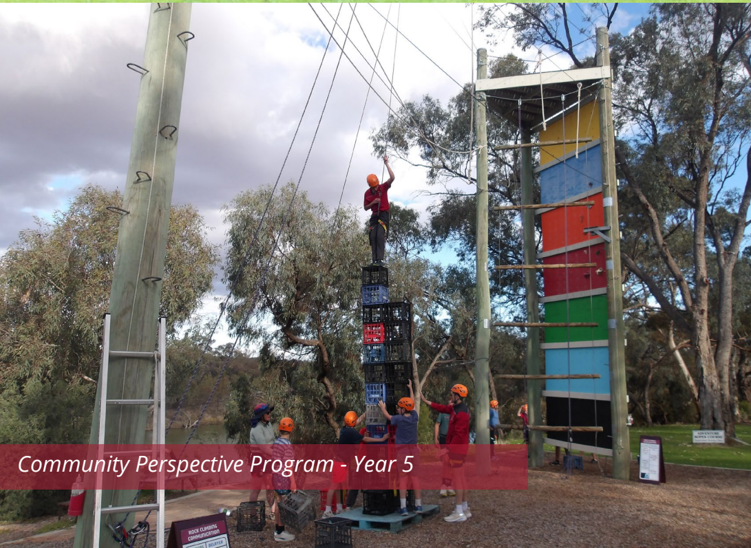
Community Perspective Program - Year 5