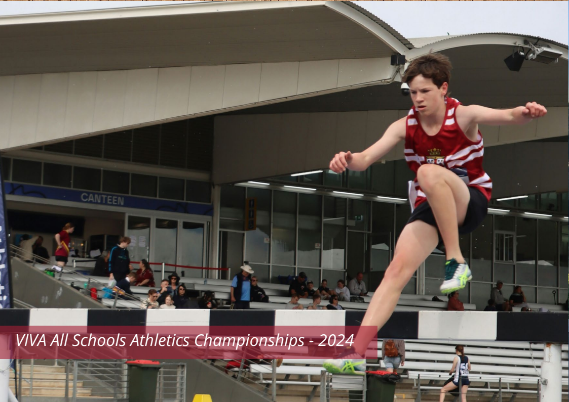
VIVA All Schools Athletics Championships - 2024