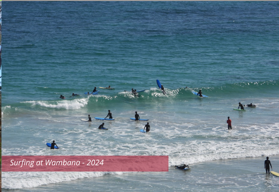
Surfing at Wambana - 2024