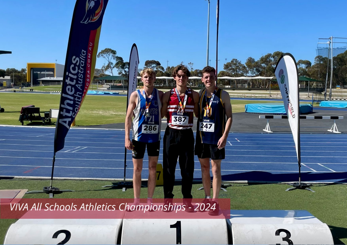
VIVA All Schools Athletics Championships - 2024