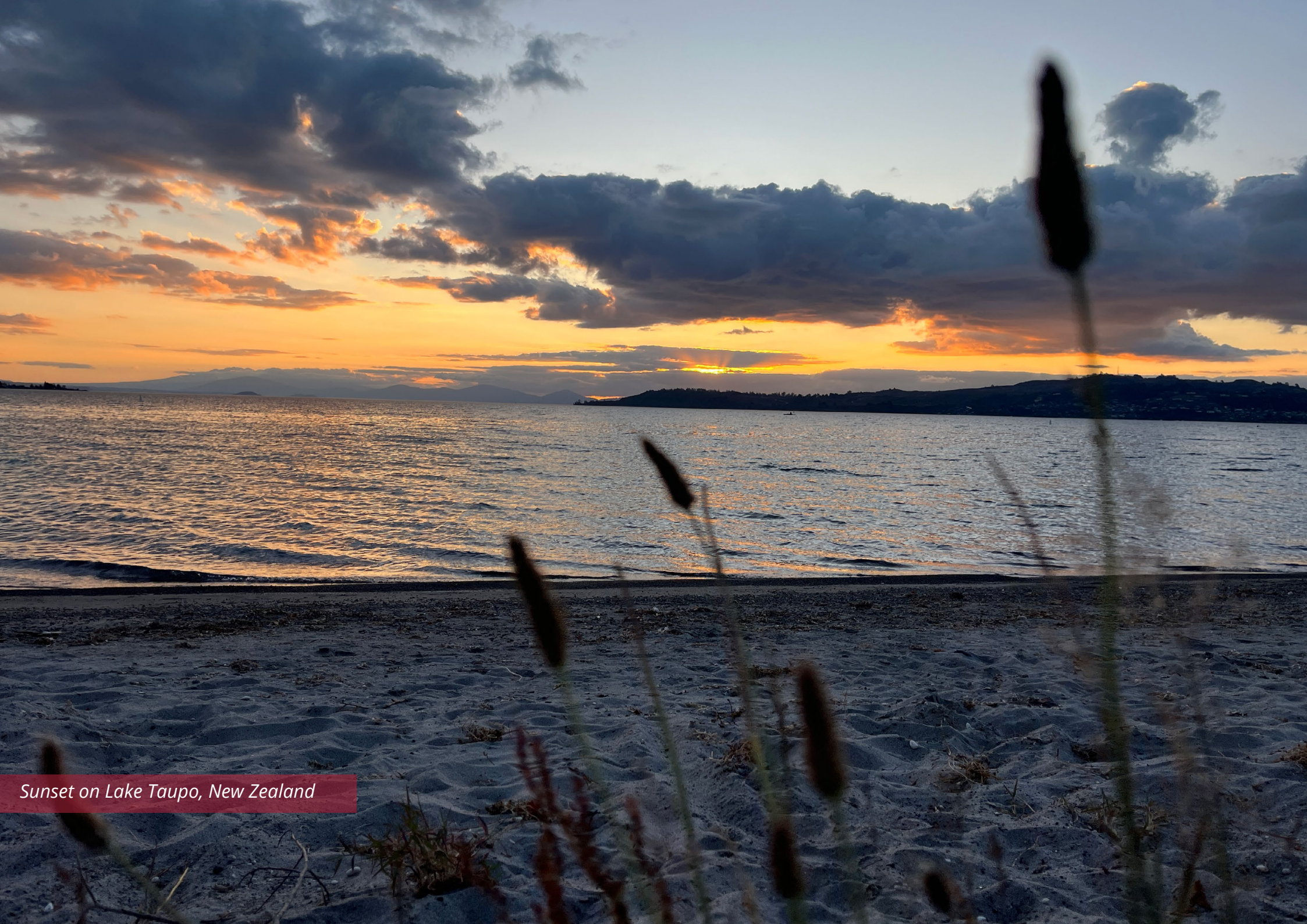
Sunset on Lake Taupo, New Zealand