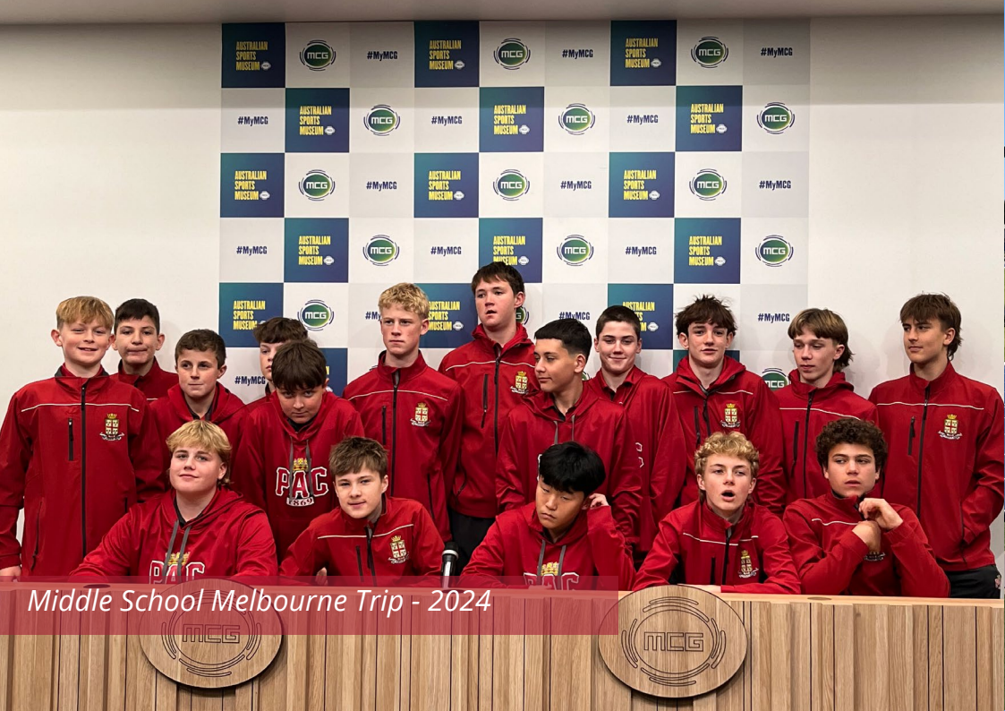
Middle School Melbourne Trip - 2024