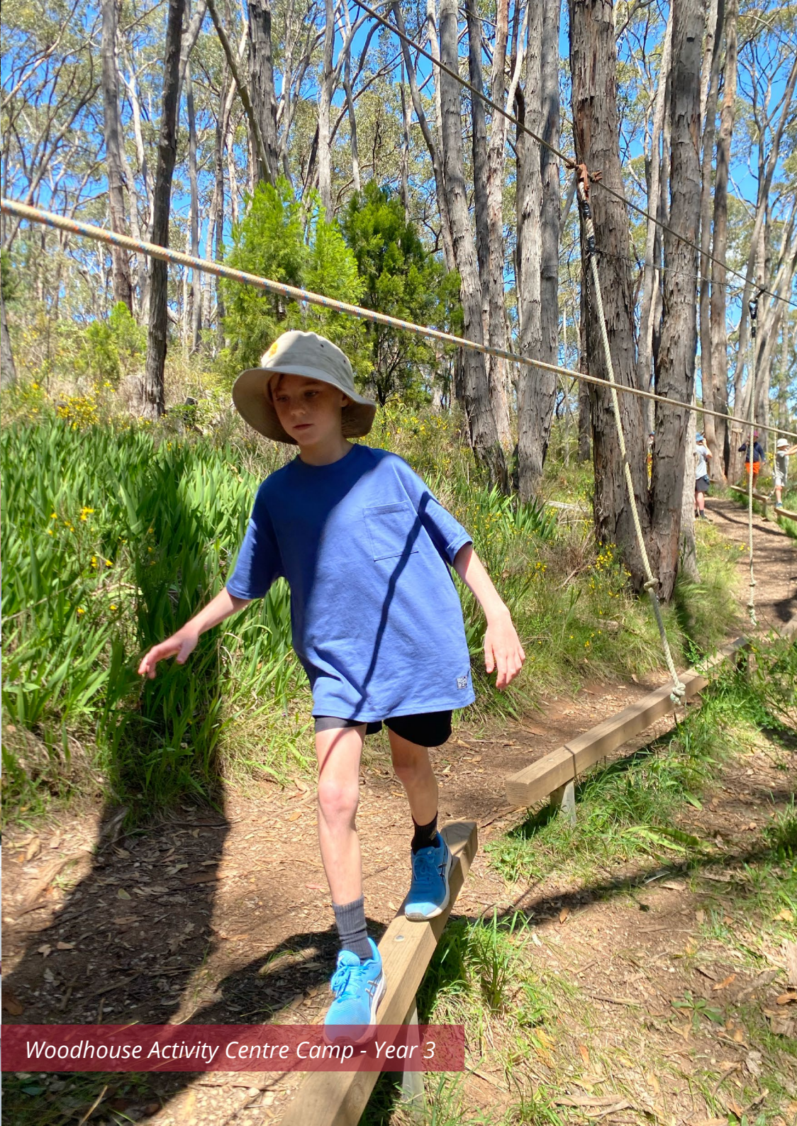
Woodhouse Activity Centre Camp - Year 3