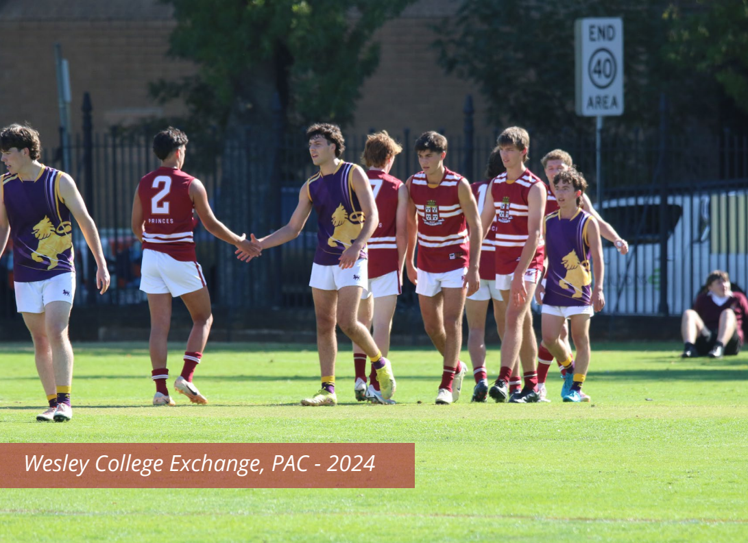
Wesley College Exchange, PAC - 2024