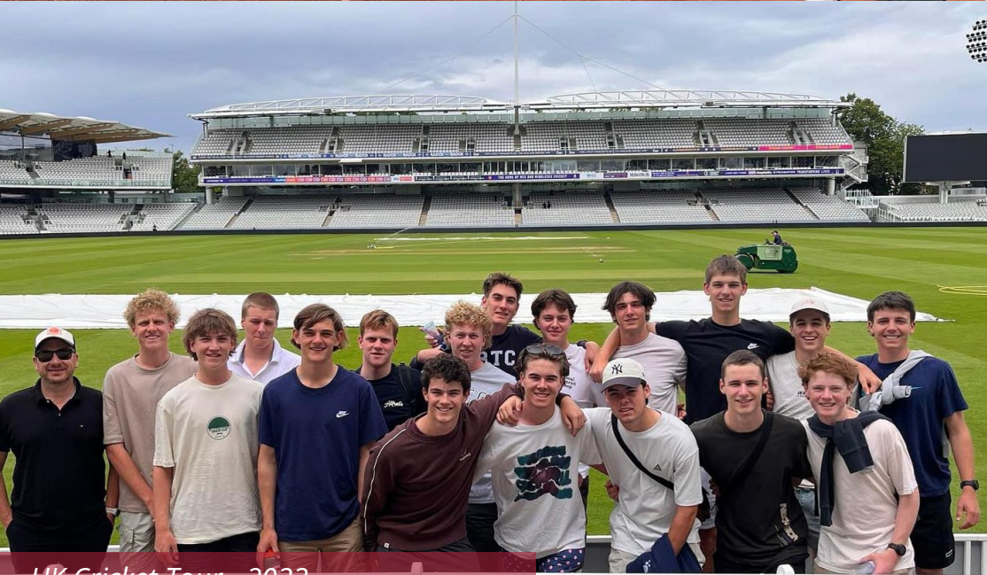
UK Cricket Tour - 2023