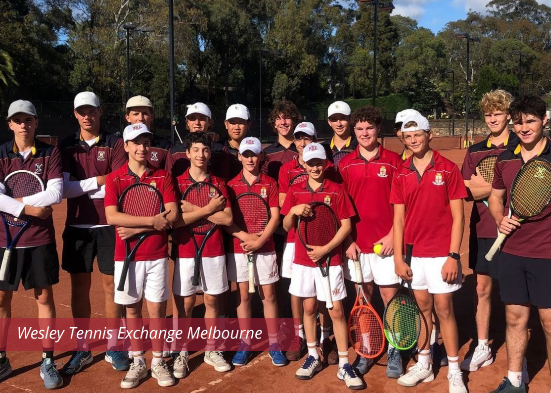
Wesley Tennis Exchange Melbourne