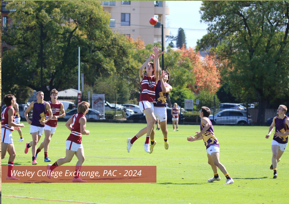
Wesley College Exchange, PAC - 2024