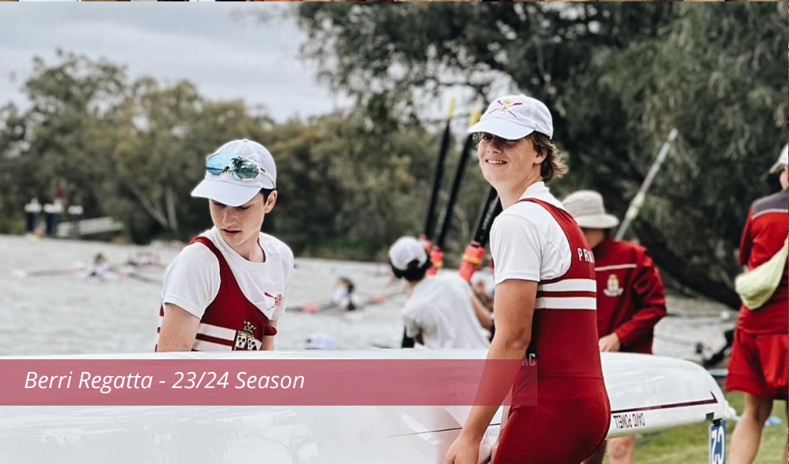
Berri Regatta - 23/24 Season