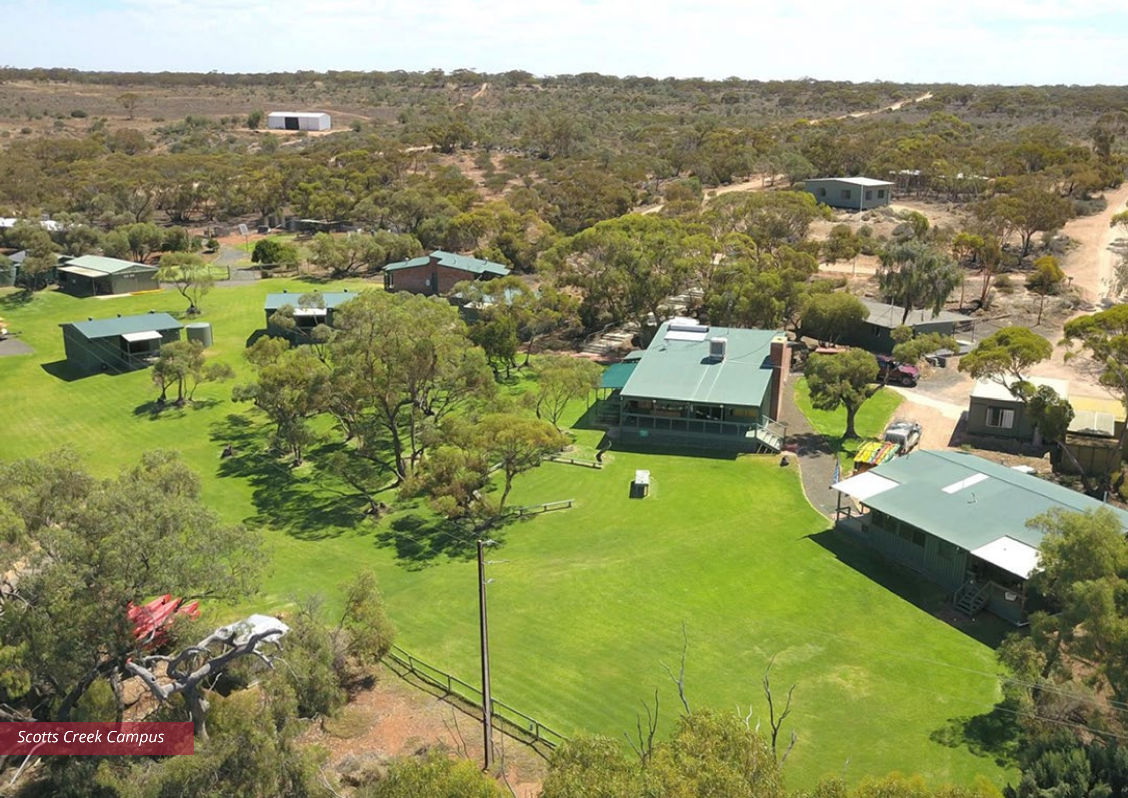
Scotts Creek Campus