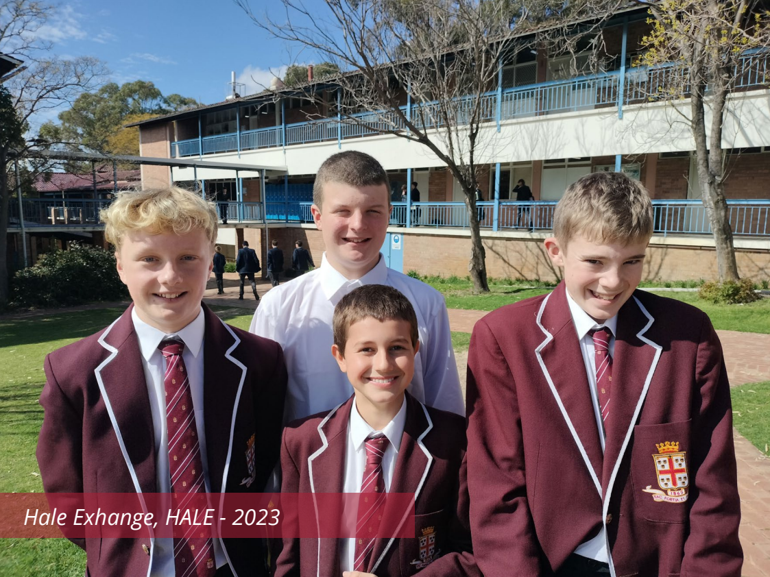
Hale Exchange, HALE - 2023