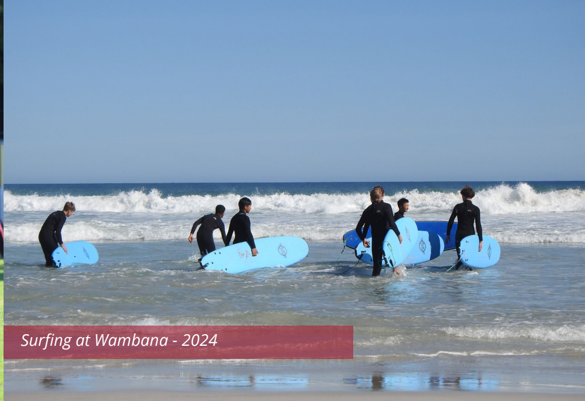
Surfing at Wambana - 2024