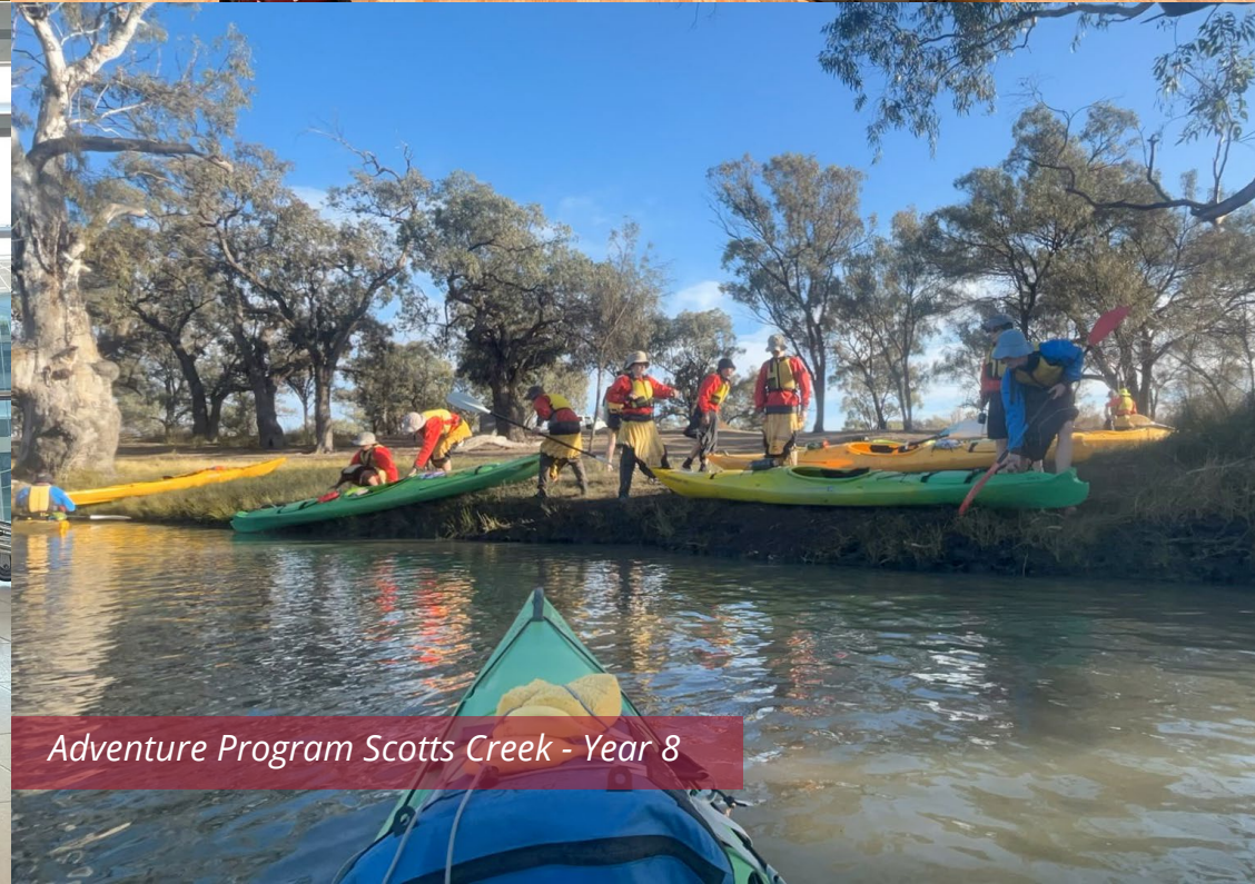
Adventure Program Scotts Creek - Year 8