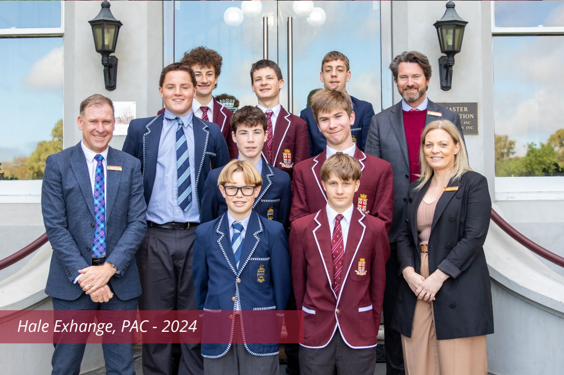
Hale Exchange, PAC - 2024