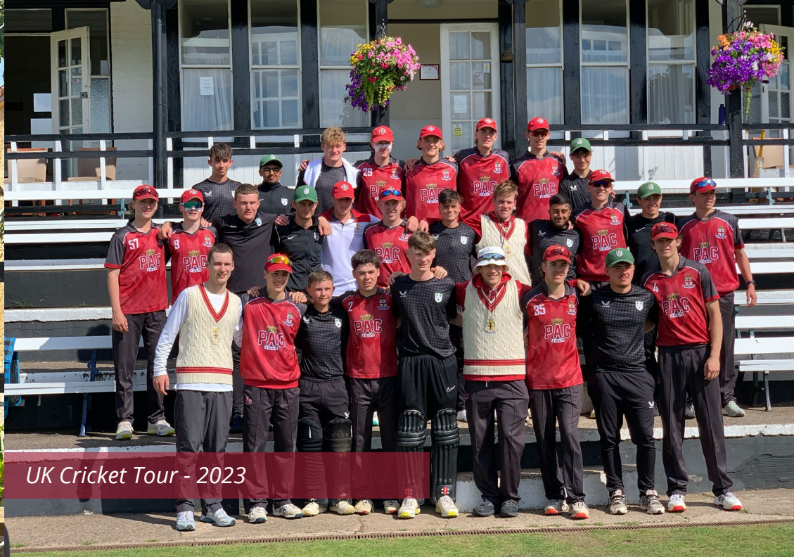
UK Cricket Tour - 2023