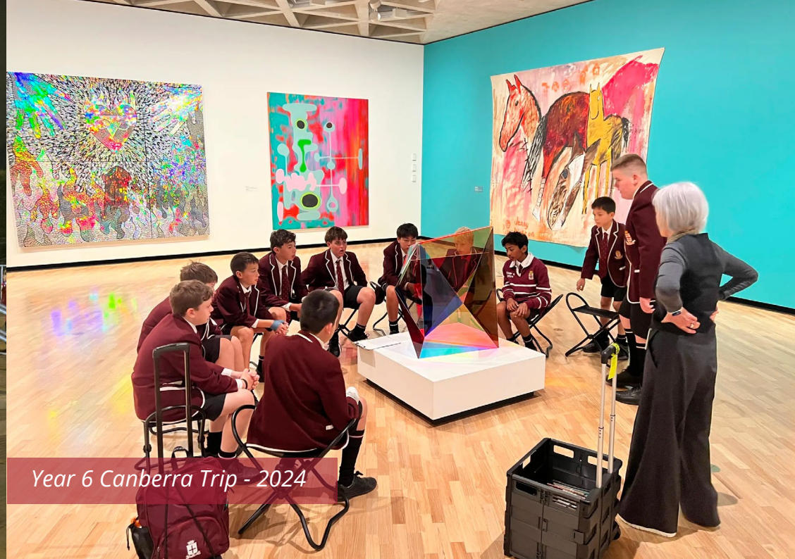
Year 6 Canberra Trip - 2024