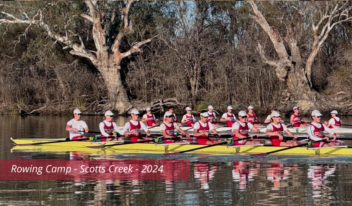
Rowing Camp - Scotts Creek - 2024