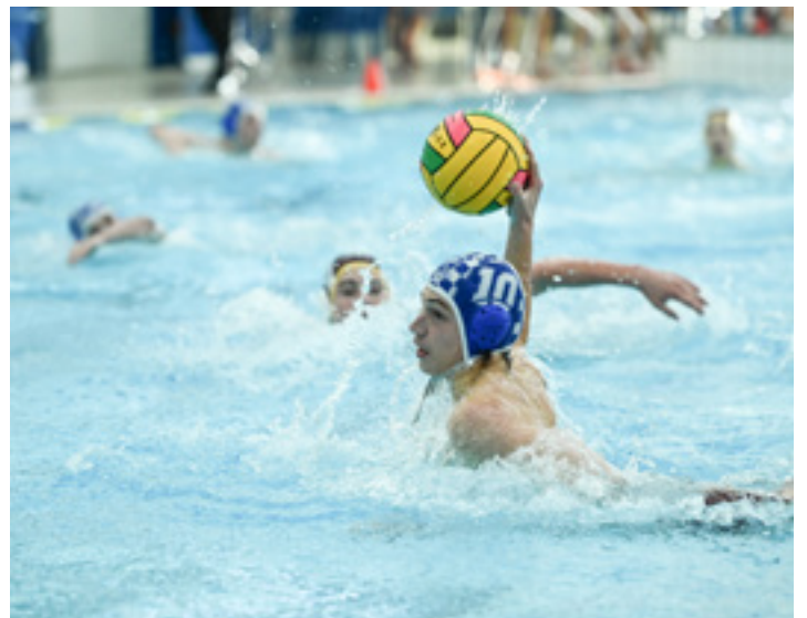
Prince Alfred College