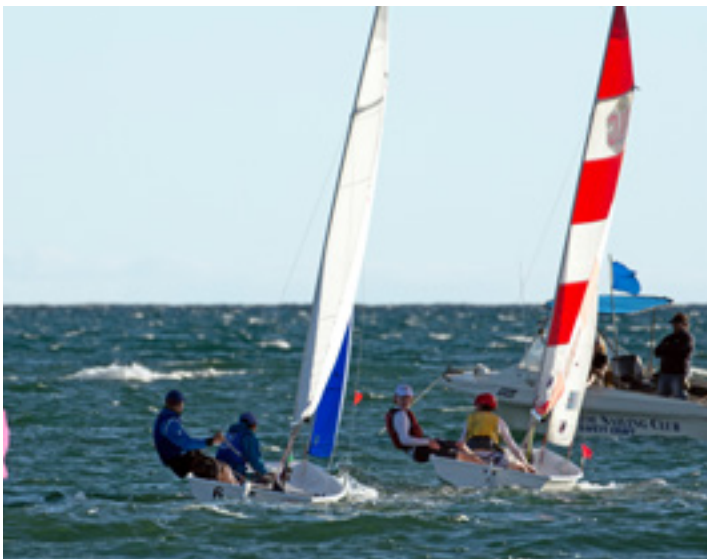
St Peter's College